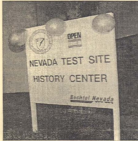
A new sign marks the entrance to the NTS History Center in Building B-3 of the Bechtel Nevada complex, at the intersection of Losee Road and Energy Way in North Las Vegas, Nevada.

The NTS Historical Foundation (NTSHF) opened its Nevada Test Site History Center on June 3, 1999. The initial opening was from noon until 4 p.m. Over 30 visitors expressed their appreciation for the hard work involved in developing displays, including renovation of the Jackass Flats Railroad model train.