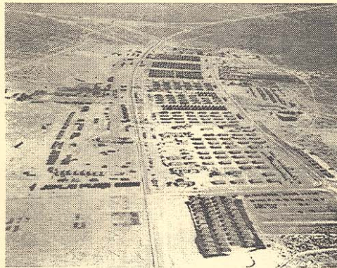
1955 Aerial Photograph of Camp Desert Rock, Nevada Test Site.

The camp was operated by the Sixth Army between 1951 and 1955 as a staging area to accommodate up to 6,000 troops from all four military services involved in training exercises associated with nuclear weapons testing on the Nevada Test Site. The camp included an airstrip (still used), approximately 100 "semipermanent" buildings and 500 tents for housing, administration, storage, and other uses. In addition to numerous aboveground fuel storage tanks located throughout the facility, there were three 10,000-gallon underground fuel storage tanks. Camp Desert Rock was dismantled after 1958, leaving the underground